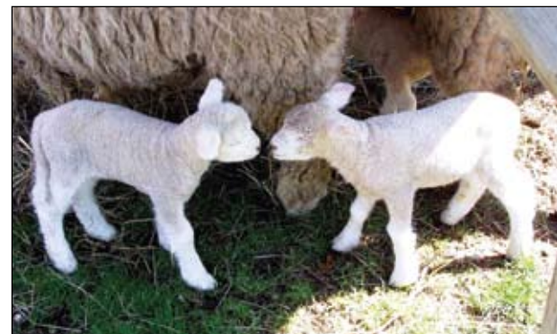
Lamb twins born in early April