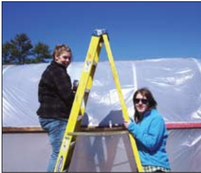
Students from Casco Bay High School in Portland working during their Farm School experience