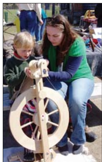
Learning to spin