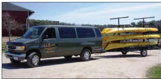
Thanks to LLBean for their generous donation of six tandem kayaks for Summer Camp.

This year we are excited to offer the Green Energy Project , a new program for high school students. These students will spend two weeks at the Farm learning about the need for renewable energy and becoming advocates of solar power, as they construct a solar panel at the farm. The students will learn leadership and problem-solving skills and apply those to real and pressing environmental issues! If you know of a high school student who might be interested, please have